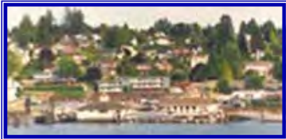
The Town of Steilacoom