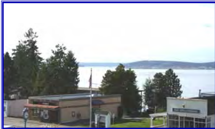
View from your new office suite looking Southwest over Puget Sound.