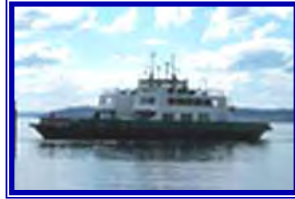
The Anderson Island Ferry