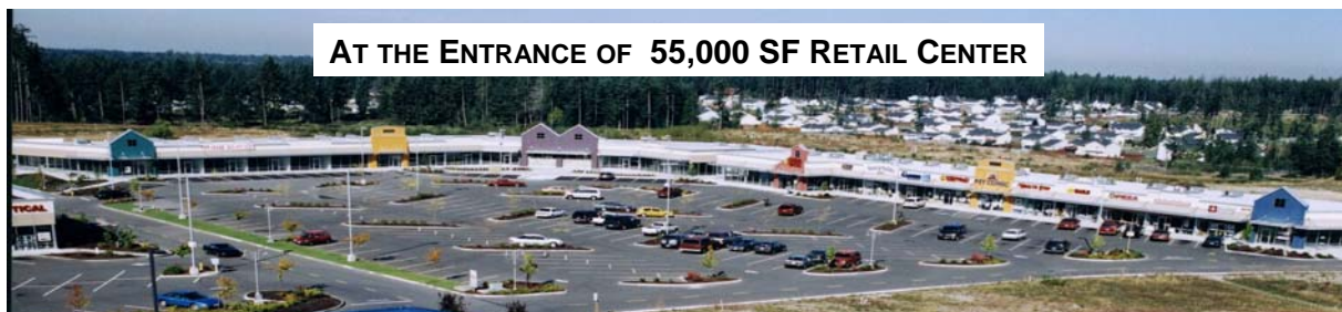
AT THE ENTRANCE OF 55,000 SF RETAIL CENTER